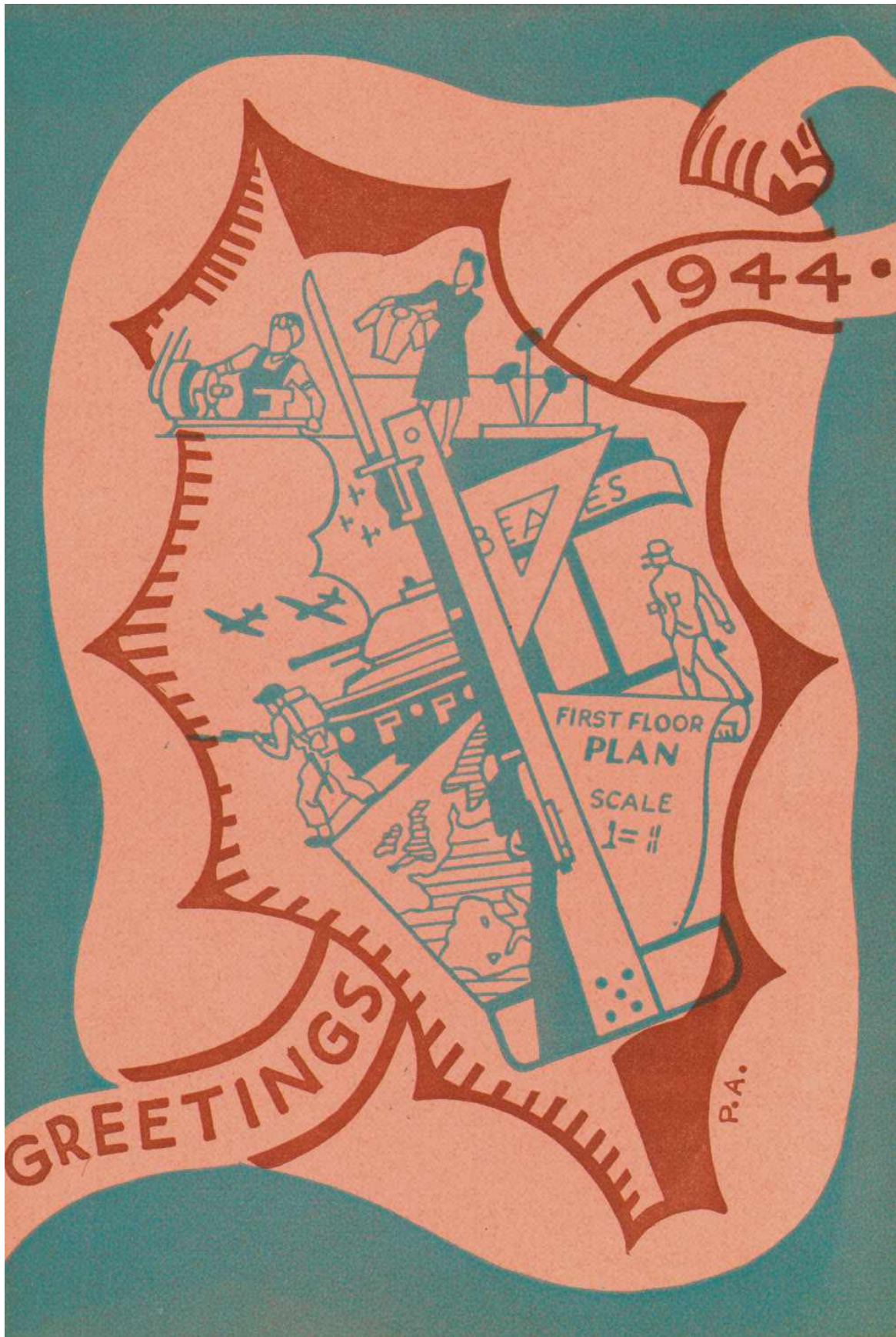
By 1944 Beales had built - and lost - a fine multi-storey Art Deco store. Less than 10 years old, the store was destroyed by fire in May 1943, following an air raid. Among the illustrations of wartime paraphernalia, we can see 'plans' and a set square. Clearly already looking forward to better times ahead.....again!